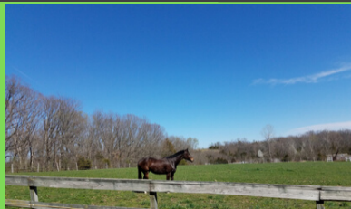
Original Cell Phone picture

TELL A STORY- INSTEAD OF A SELFIE WITH YOUR FRIEND CROPPED IN CLOSE ASK SOMEONE ELSE TO TAKE THE PICTURE FOR YOU AND CAPTURE SOME OF THE SCENERY OR ACTIVITY AROUND YOU