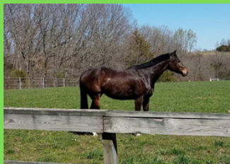
Cell phone picture cropped in subject

DON'T ZOOM- ZOOMING IN WILL RESULT IN BLURRY OR UNCLEAR PICTURES ON MOST CAMERAS. INSTEAD TAKE THE IMAGE AND CROP IN ON THE SUBJECT